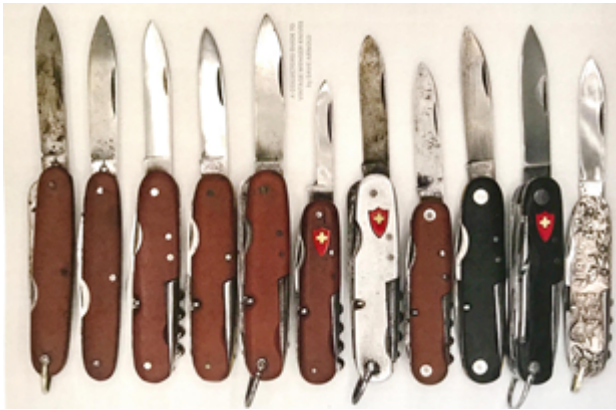
Photo: Officer knives by Wenger, 1905-1914.

Besides Soldiers and Officers knives we see a lot of rare models of farm knives, fixed hunting knives and even different versions of Hobo set made by Wenger.