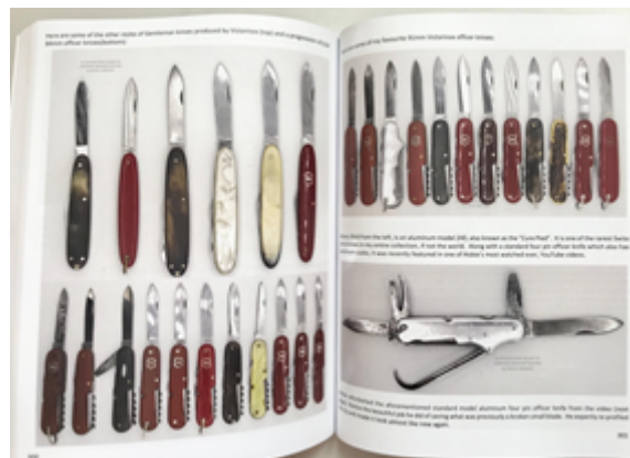
Photo: Victorinox knives.

Other knife manufacturers from Switzerland and Germany are also featured in the book. Here's a great set of vintage Victorinox knives including extra rare aluminum mod. 240 from 1903 Elsener Catalog.