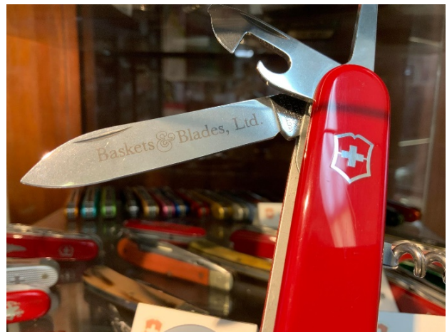
Photo: A knife with some interesting history.

Many of the original baskets are still scattered around our shop today, made of the highest quality full willow. Similar to our beloved Swiss Army Knives, they have proven their worth in the test of time.