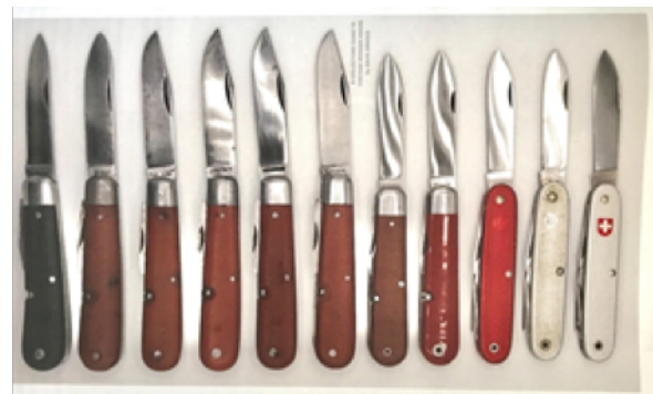
Photo: Swiss Army Soldier knives made by Coutellerie Suisse/Wenger in 1900-2007.