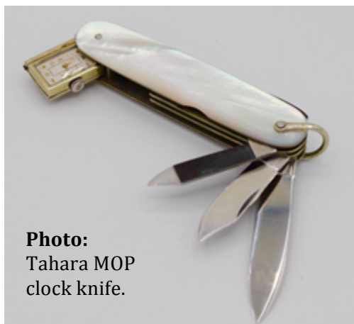
Photo: Tahara MOP clock knife.

A rare example of a Wenger knife with a clock (only one is known to be in its complete state):